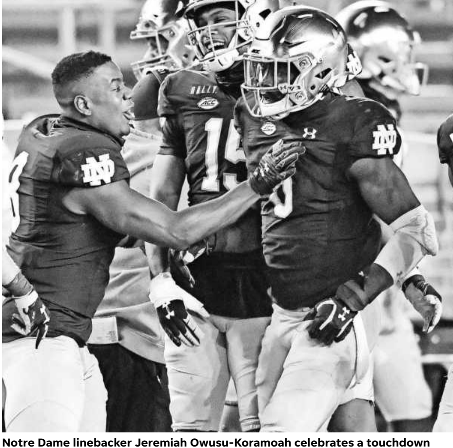
against Clemson on Saturday night.

Brigham Young will also test the committee. Beating Boise State handily helps the Cougars' case, but the committee won't be too impressed by the team's overall strength of schedule. In the end, however, BYU's high quality of play could be too much to ignore.